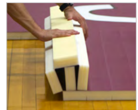
Sections should be rolled tightly for easy handling.

We recommend that the rolls be stored standing on end, but they may also be stored on their sides and stacked. It is important that they are stored on a clean, smooth, flat surface and away from any sharp objects; storage bags are recommended. Temperature does not affect the mats and they can be stored in areas without heat or AC. If they are extremely cold (below freezing), you should wait for them to warm up before unrolling.